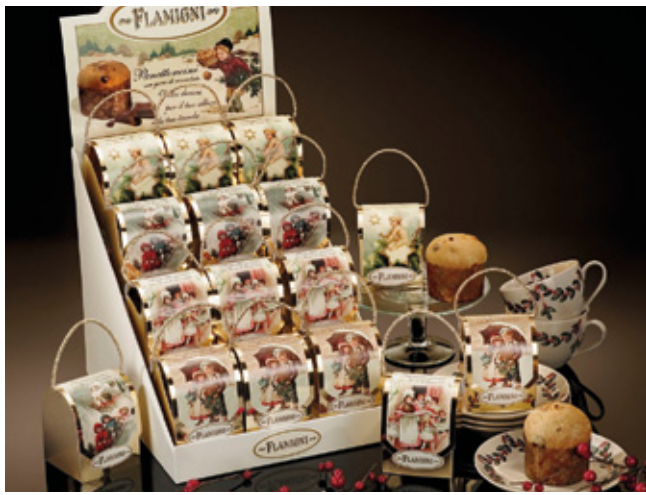
Mini Panettoni with Chocolate Chips. 3 x 12 Unit display Boxes x Carton