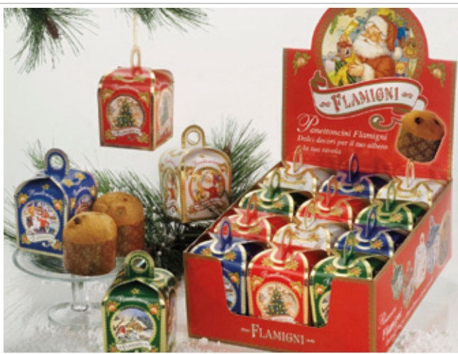
Panettoncini Milano Hanging Case. 3 Display x 12 Unit.