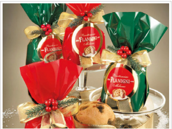
Green, Gold and Red Wrap.