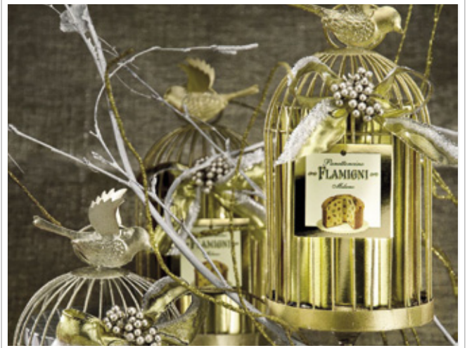
Mini Panettoni Milano in small Gold and Silver Birdcage candleholders